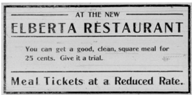
The Palisade Tribune - July 2, 1904

It was a fun day of great food, conversation and collaboration. Thank you to Plateau Valley Historical Preservation Society for spoiling us!