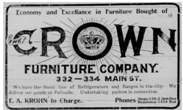
The Palisade Tribune - July 2, 1904

Looking south from the U.S. Highway 6 Bridge just east of Palisade, you can see the diversion dam for the Grand Valley Canal is barely visible to the right as water fills the Colorado River just east of Riverbend Park. Last year's high mark of 10,200 cfs at Cameo was early- on May 25th at 7:30 am. (Source: www.waterdatausgs.gov .)