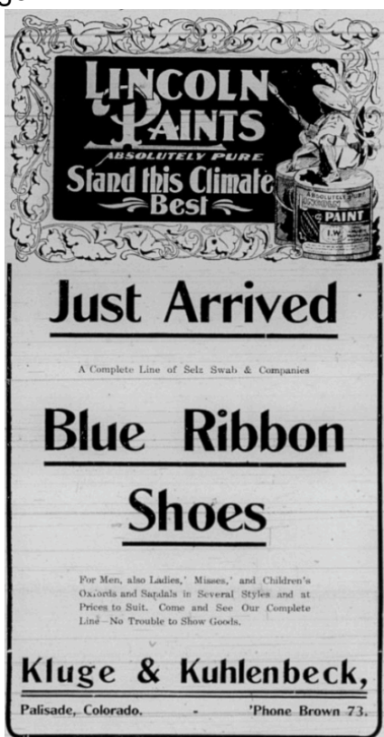
The Palisade Tribune - July 2, 1904

Throughout this Newsletter, you will see ads from past issues of The Palisade Tribune . The ads in this issue are from July 1904. It's a small glimpse of life in Palisade from 120 years ago!