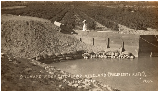
Historic photo postcard of a woman in a white dress at Orchard Mesa Irrigation District in 1910.