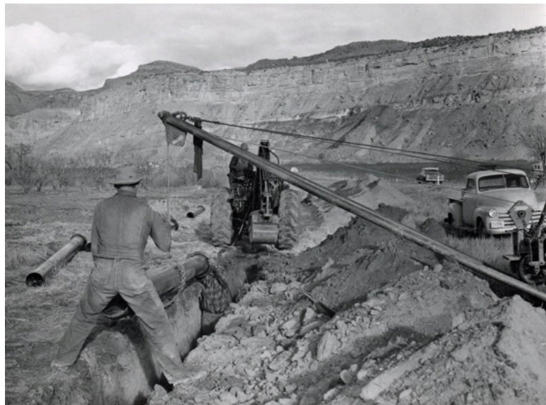
Laying municipal water pipes in the Vineland.

photos with the Historical Society, including photos of the Town's water system improvements in the 1940s. His father was the Town Manager from 1935 until he retired in 1972.