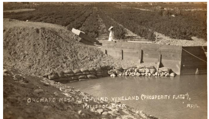
Historic photo postcard of a woman in a white dress at Orchard Mesa Irrigation District in 1910.