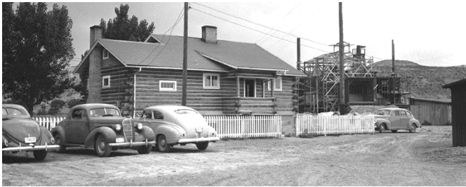
Historic photo of the Log Cabin and Refinery at 2597 Legacy Way in Grand Junction