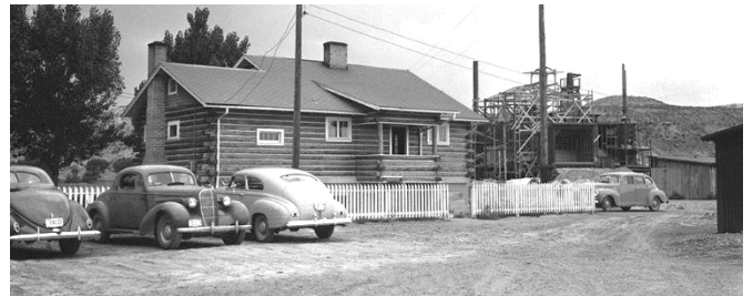
Historic photo of the Log Cabin and Refinery at 2597 Legacy Way in Grand Junction

Legacy Management will explain how uranium changed Grand Junction at a critical time in the nation's history. She will also explain the mission of the U.S. Department of Energy Office of Legacy Management today. The Atomic Cabin celebrated its 80 th anniversary earlier this year.