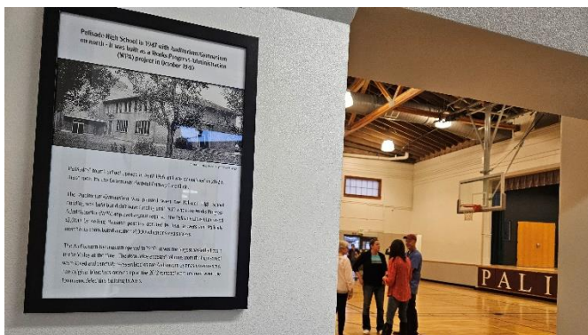
One of 20 photos with information about Palisade schools, student organizations at the school, and other history which the Historical Society researched and printed to be displayed throughout the building.