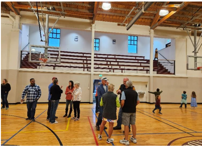
The interior of the Auditorium-Gymnasium with the refurbished bleachers in the balcony on October 24 official dedication night.

The Historical Society provided 20 historic photographs and information about the history of it and other school buildings on the property over the years. The original 1926 building and the east wing added in the early 1950s were demolished earlier this year to make room for the new Community Hospital Clinic which opened earlier this year.