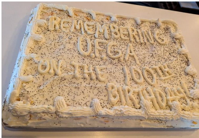
100 th birthday cake celebrating the United Fruit Growers' Association founding in April 1923.

We also celebrated the 100 th birthday of the United Fruit Growers' Association (UFGA) which was founded in April 1923. Guests at the April history talk were treated to a slice of delicious peach flavored birthday cake from Slice O Life Bakery.