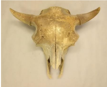
Bison Skull

The history talk program will begin at 6:00 p.m. on Thursday, January 19 th at The Ordinary Fellow Winery – at 202 Peach Avenue in Palisade. This program is open to the public, and The Ordinary Fellow Winery is a relaxed and comfortable setting for people to learn about Palisade’s unique history and enjoy a glass of wine. As food will not be available on site, people can bring food to the program.