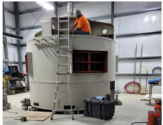
The new 4.5-megawatt generator produces 1.5 megawatts more power than the previous one using the same amount of water