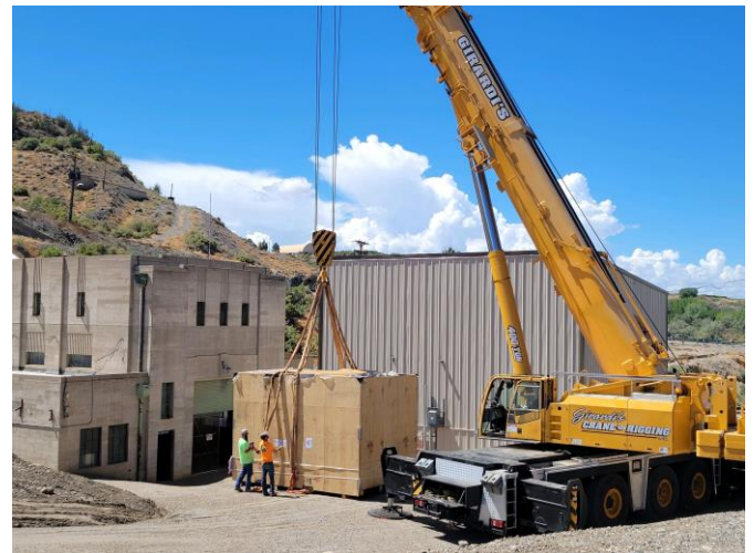
400-ton crane unloading the 75,000-pound rotor