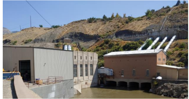
The four penstocks pumping irrigation water to Orchard Mesa are on the right. The 1933 hydro plant is still visible in the center, with the new plant building now on the left.

construction phase the first week in September and the new plant could be generating power later this month!