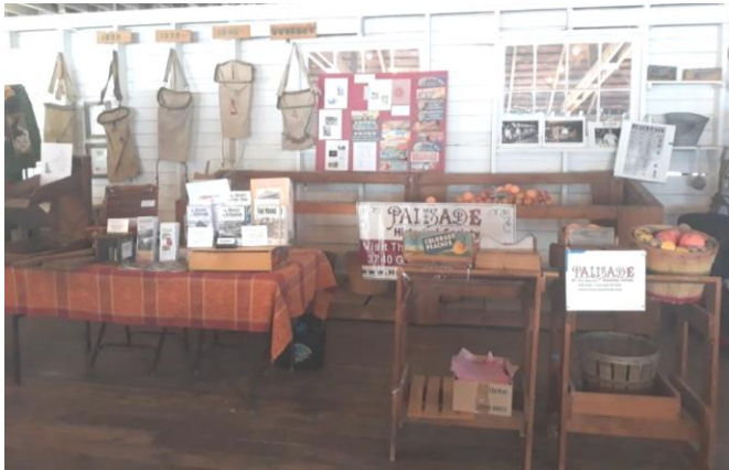
Historical Society Display at Fall Day on the Farm in August included our publications, information, and peach packing stands

The Historical Society's display in the Cross Orchards Barn was near an actual bin used in a Palisade packing shed. The picking sacks on the wall included one invented in Palisade in 1900. The Society's many publications and historic photos of processing peaches were on display.