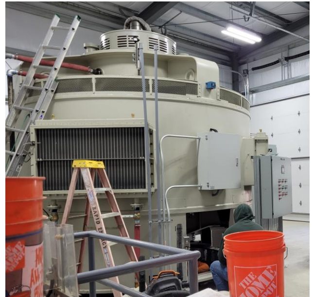
Generator being installed at the new Vineland Power Plant in October.

The generator is installed in a new building and after testing, is scheduled to go online the second week in November. The official dedication ceremony will be held in December.