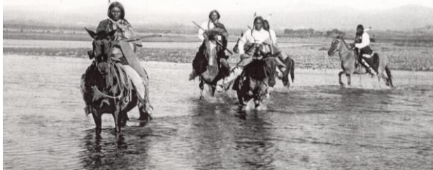
Ute Indians in Western Colorado