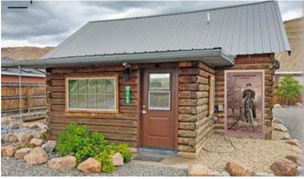
The Palisade History Museum at 3740 G Road has had over 600 visitors since May 2021