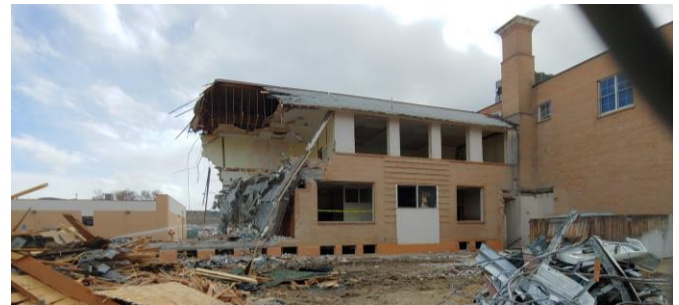
Most of the east wing was demolished March 2, 2022. It was more difficult than the west wing which opened for classes in April 1926.

The east wing of the school was new in 1953. The gym/auditorium on the right was a WPA project completed in 1940. Over the years, the east wing included the main office, principal's office, shop, and math classes on the first floor. The second floor sometimes had the teachers' lounge, home economics, and science classrooms, and the entrance to the band room above the auditorium.