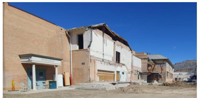
The first wing on the west side is gone. Under discussion is restoring the bleachers on the south side of the gym/auditorium. Page 2