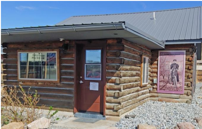
History Museum with "Aunt Emma" on the right

If you have stopped, driven, or ridden by lately, you've noticed some wonderful changes to the outside of the History Museum at 3740 G Road.