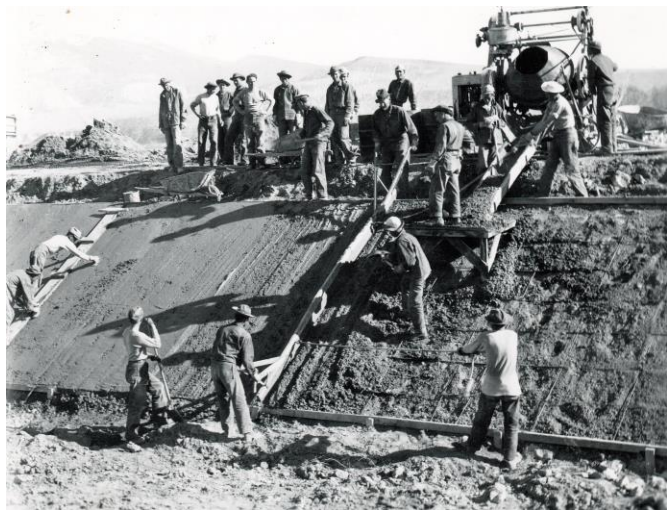
CCC Camp workers pouring and smoothing concrete to line the side of the Government Highline Canal in the late 1930s. The current salinity work uses much different materials and methods.