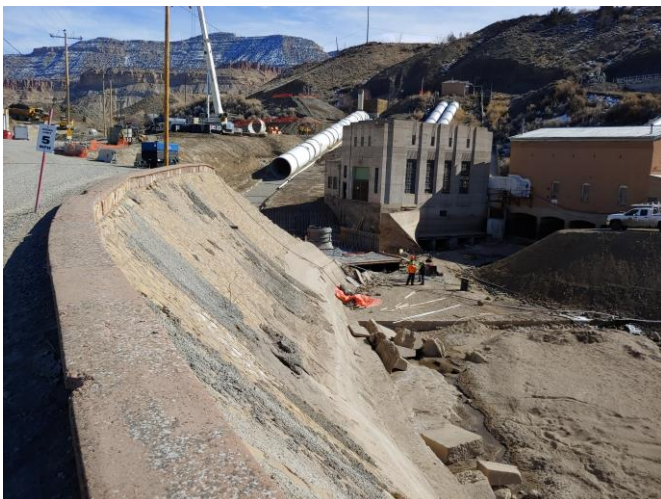
February 2022 work at the OMID hydro plant

In an amazing coincidence in the first week in February, the current work at the OMID was being done in the same place! The new hydro plant is being built next to the original 1933 building. The large pipe on the left will be extended and carry water from the power canal to the new plant.