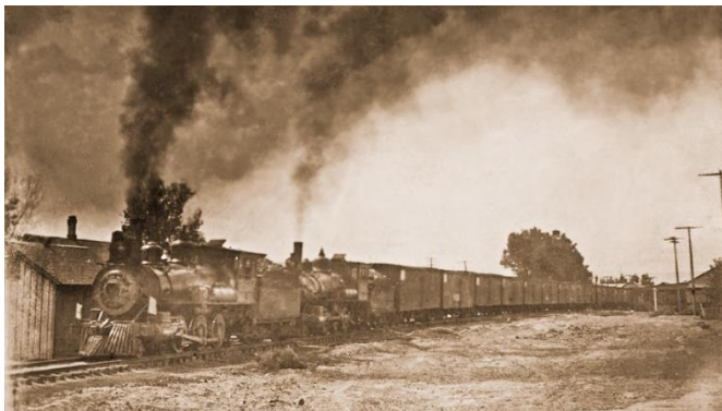
First Colorado Midland trainload of peaches shipped from Palisade.