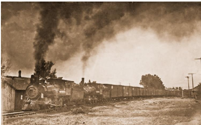
First Colorado Midland trainload of peaches shipped from Palisade.