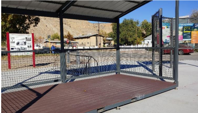
Sign and the bike rack at the bus stop

Palisade's success as the center of Colorado's peach growing area. The most prominent building was Palisade's first City Hall behind the concrete where trucks were weighed with and without their loads.