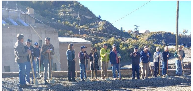
Official groundbreakers used gold-colored shovels to begin construction of a 4.5-megawatt facility to replace the historic hydro plant which can be seen in back on the left.

The new hydro plant, the Vinelands Power Plant, will be another clean energy generator providing even more power to the grid than its predecessor. Sorensen Engineering is constructing the new facility which will be built in front of the historic plant. The nearby plant which pumps irrigation water to both canals on East Orchard Mesa will remain operating seasonally as it has since 1910.