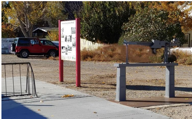
Sign with restored scale which was inside the City Hall at that location before 1968

The new sign also includes photos of the nearby fire department, Peach Board of Control and Insectary building which is now a private residence and a photo view north to the palisades in 1908.