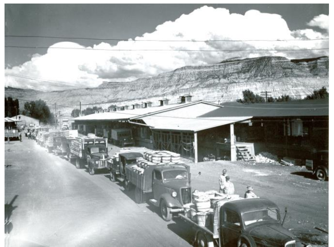
One of the historic photos at The Ordinary Fellow Winery which gives visitors insight into the area's history (continued)