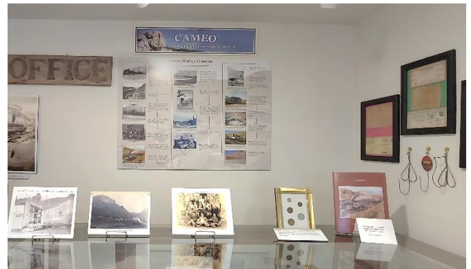
New timeline on wall in Museum's Cameo exhibit

A new display which visually illustrates the unique history of Cameo as a coal mining town, then a Public Service Co. coal-fired power plant, and now, a shooting and education complex, is now in the Cameo exhibit at the History Museum. Graphic Artist Gayle Madden created it – and a similar one on display at the Shooting Complex in Cameo.