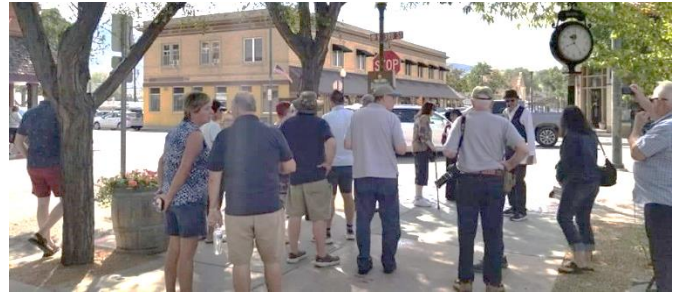
Durant Automobile Club Members gathering in the Palisade Plaza before the tours

Durant-Era Locomobiles, and Continental. The founder of General Motors was William C. Durant. Automobile Club members came from all over the country and also enjoyed visiting Suncrest Alpaca Farm and lunch in Palisade that day.