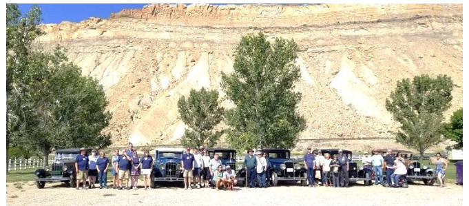
Club members and their vintage cars in the parking lot north of the railroad tracks