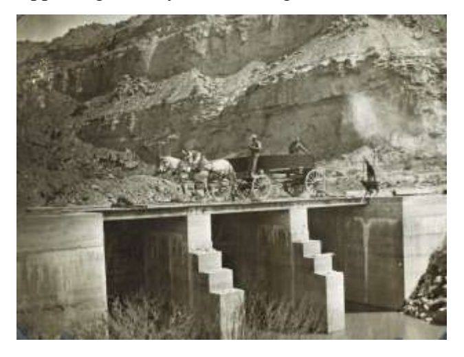
wheels weighing 7 1/2 tons to the pumping plant.

In 1903, the Highline Mutual Irrigation Company authorized the construction of the Stub Ditch which used a pump to lift water from the River. These photos show pumping machinery being installed in 1903 for the Mesa County Irrigation District which operated the Stub Ditch. The Leffell Turbines lifted 10,000 gallons per minute, each with 350 horse power. In the photo in the upper right, they are hauling the 15 ft. sheve