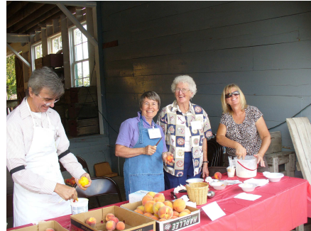
Palisade Historical Society “slicers and scoopers” at the 2011 MCHS picnic