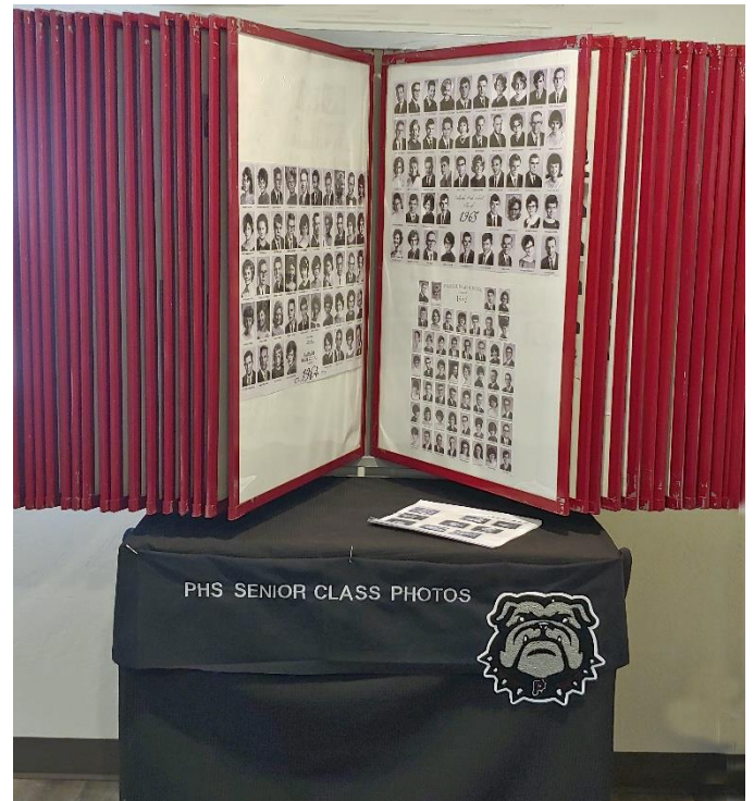
PHS Senior Class Photo display at the Museum