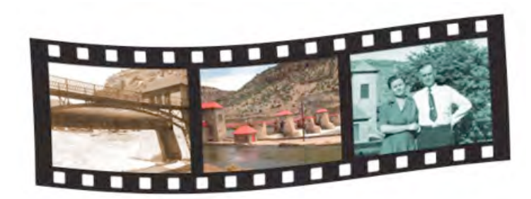
Spend an enlightened 15 minutes viewing one of our videos.

Don't miss this year's Olde Fashioned Christmas with the Palisade Historical Society on Saturday, December 6th We will offer our Historic Guided Walking Tours of downtown Palisade at 10:30 a.m. and 12:30 p.m. For a $5 donation, you can select from four different tours. All tours start from The History Center at 311 South Main Street and take about an hour.