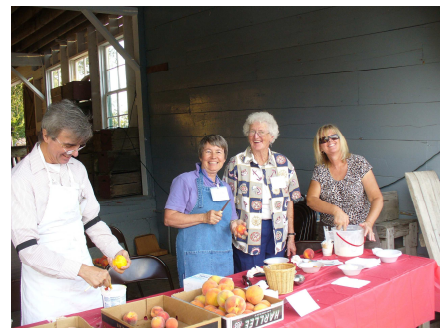
Palisade Historical Society "slicers and scoopers" at the 2011 MCHS picnic