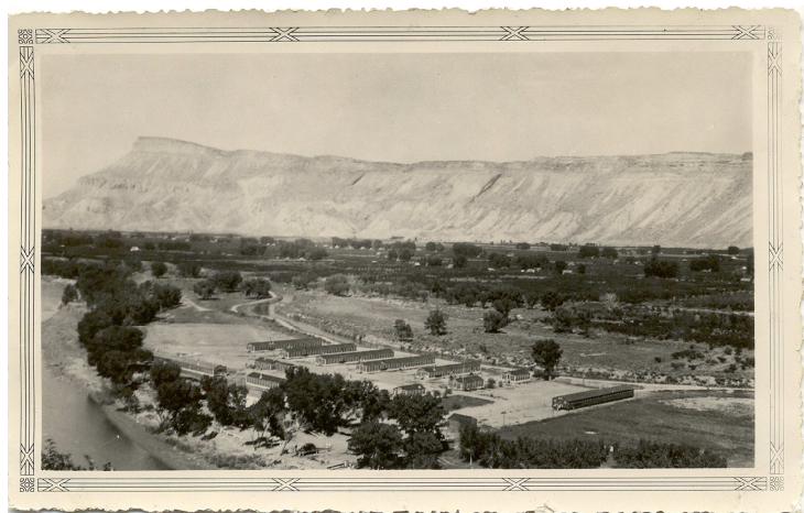
Camp Mesa – CCC Camp BR-59-C in 1939

The Palisade Historical Society will present a program about our Civilian Conservation Corps (CCC) Camp in Riverbend Park for the Mesa County Historical Society's monthly Oral History program. It will be at 12:00 noon on Thursday, May 16 , in the Whitman Building at the Museum of Western Colorado, 248 South 4 th Street (4 th and Ute), in Grand Junction.