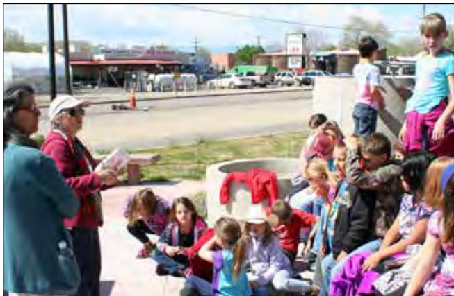
Third graders from three Taylor Elementary classes enjoyed guided walking tours that ended at the Wayne N. Aspinall Memorial in Palisade Park.