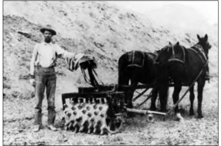
Tamping the Government High Line Canal bottom.

The first work on the High Line Canal began July 1, 1913. By August, about 240 men were employed in tunnel work and sixty-five men were working for contractors to excavate connecting canals. By the end of 1914, over 600,000 cubic yards of earth had been removed. The final contract for the main canal was completed June 15, 1915 six weeks ahead of schedule.