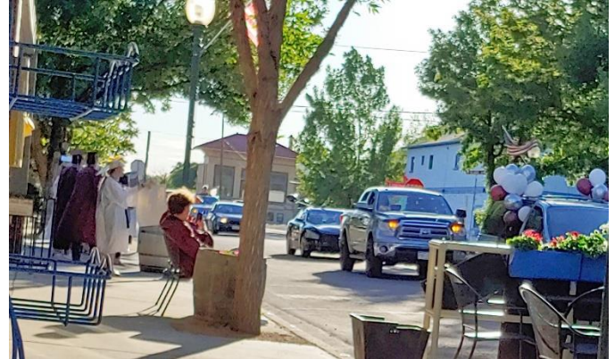
A group of PHS senior boys sat near the Family Food Town wall on Third Street

On May 25 th , which was Memorial Day, graduates were encouraged to wear their gowns and line the usual downtown Palisade parade route to enjoy enthusiastic friends and family honoring them.