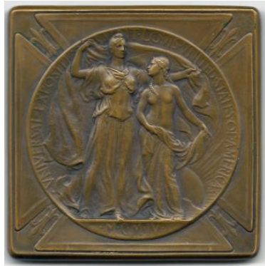
Silver Medal won at the 1904 St. Louis Exposition for Palisade apple exhibit