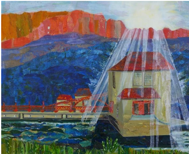
Sylvia Wilhelm's "DeBeque Canyon Roller Dam"

birthday celebration in June 2015. Sylvia had a different entry in the "Dam Art Show" held in conjunction with the birthday party.