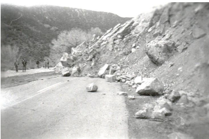
The earthquake caused a rockslide on Highway 65 in Plateau Canyon halfway between mile markers 53 and 54.