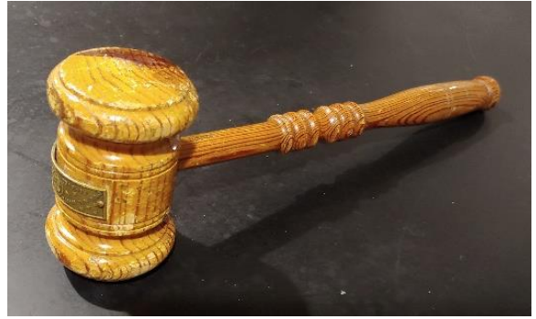
The Aspinall Gavel