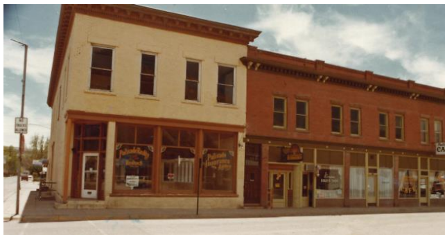
Hugus Building (left) and Hugus Addition (right) in the 1970s

Across Main Street, on the southwest corner of Third and Main, will be the Purple Cow, a new coffee shop with a drive up window in the alley at the back of Hugus Building. The space was Mumzel's coffee shop from 2012 to 2017.