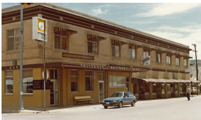
Palisades National Bank Building in the 1960s

Among the changes, J-U-B Engineers, Inc. has expanded into more offices at its storefront in the Palisades National Bank Building. This civil engineering firm has 18 offices in six states. Consequently, Longpoint Digital Computer moved from its 319 South Main location. The Palisade Chamber of Commerce is adding the corner space at 305 South Main which was the bank's location from 1909 until 2011. The former bank corner space has been vacant since March 2017.