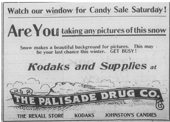
Palisade Drug Store Ad in the February 1, 1918 issue of The Palisade Tribune