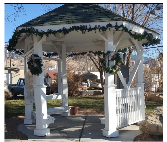
Information Kiosk on Kluge Ave. in downtown Palisade decorated for Christmas

Happy Holidays and best wishes for 2018 from the Palisade Historical Society!