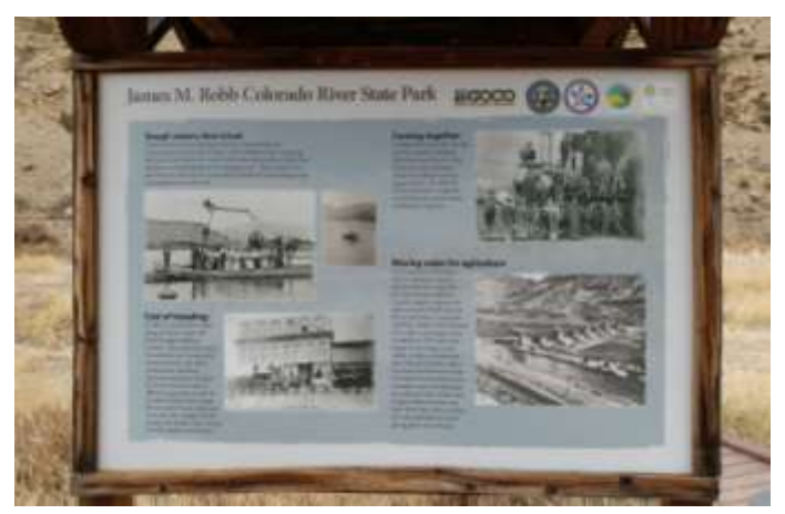
New Colorado River History Sign at Island Acres

There's a new sign with local history and photos at the James M. Robb Colorado River State Park, also known as Island Acres, off I-70 Exit 47 east of Palisade. We were pleased to be able to provide information about our vital irrigation systems and photos of the Grand River Diversion Dam, and other interesting local Colorado River history.