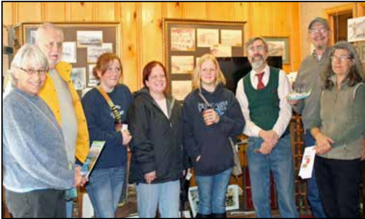
Volunteers and visitors to the History Center for the Nov 28th Art & Chocolate Walk.