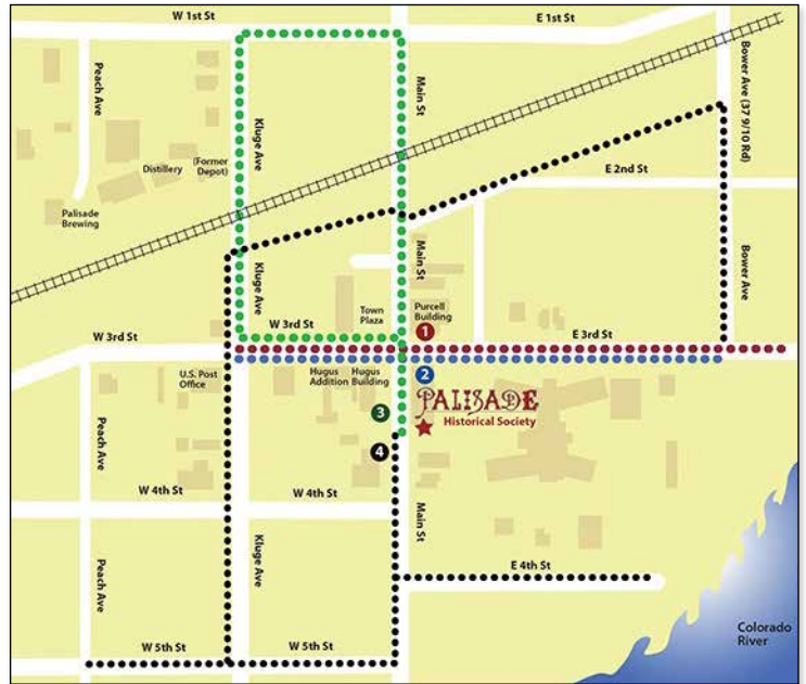
Guided Tour routes

The Historical Society will offer its popular Guided Walking Tours of Downtown Palisade at 10:30 a.m. and 12:30 p.m. on Saturday, August 15th . You can make reservations for tours in advance by calling (970) 464-2177 or stopping by the History Center. More information is on www.historicpalisade.org/index.php/historic-guided-walking-tours/ . For a $5 suggested donation, you can select from tours with different routes offered at those two times, depending on the information you want and the part of downtown you want to see.