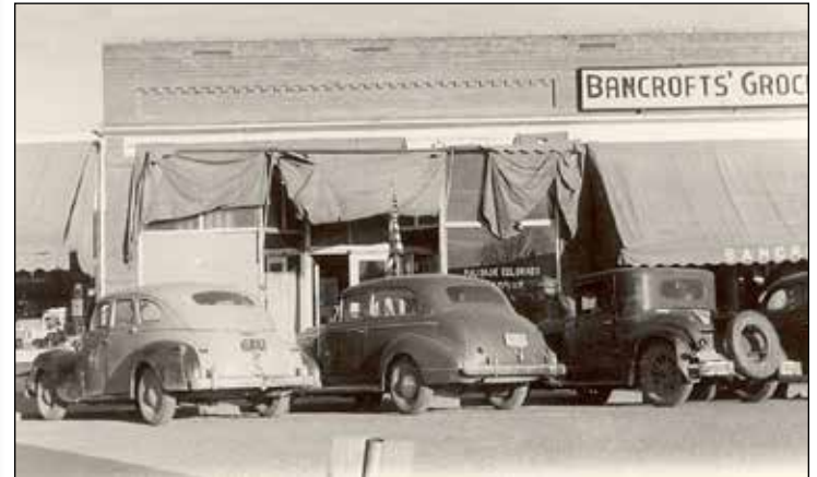
Main Street, Palisade in 1940.