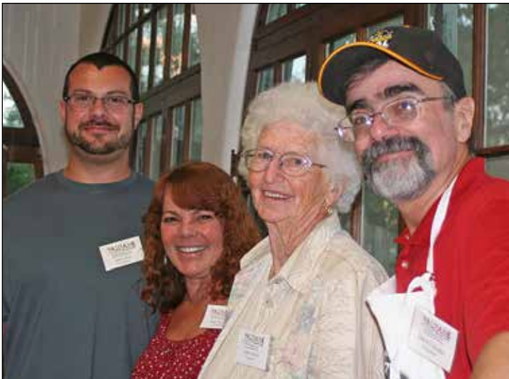
Palisade Historical Society "peach slicers and ice cream scoopers" at last year's MCHS potluck.

The Palisade Historical Society will again provide peaches and ice cream for the Annual Mesa County Historical Society potluck. It starts at 5:30 p.m. on Tuesday, August 25th at the Redlands Community Center in Grand Junction . We're serving fresh Palisade peaches. If you plan to attend, please RSVP to (970) 260-5226 or (970) 242-8478 and bring a side dish to share or a donation.