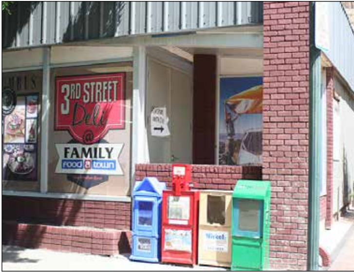
Family Food Town's 3rd Street Deli, 2015.

To the delight of locals, Family Food Town has recently renovated and created space for the 3RD STREET DELI with interesting and tasty sandwiches, cheese, meats, featuring local ingredients.