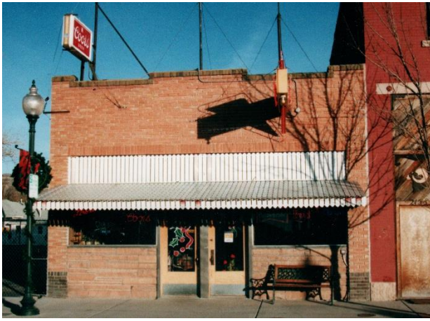
Former Palisade Liquor Store 213 So. Main Street