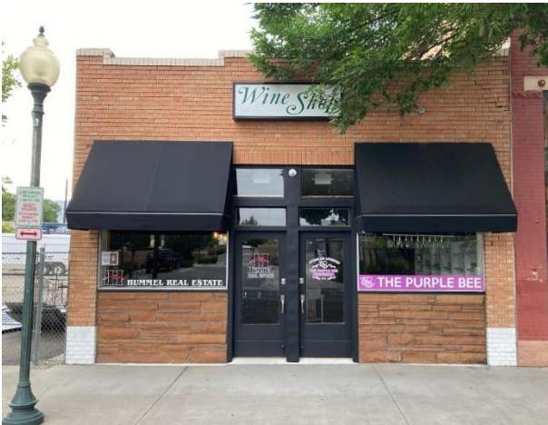
Hummel Real Estate and The Purple Bee

The long-awaited Purple Cow Coffee Shop—and our newest Historical Society Business Member—is now open in the back space of the Hugus Building 301 South Main St. (Stop #27 in our Walking Tour brochure), This locally owned coffee shop features coffee, espresso, breakfast, and lunch fare, as well as delicious soft serve ice-cream. It is open seven days (continued)