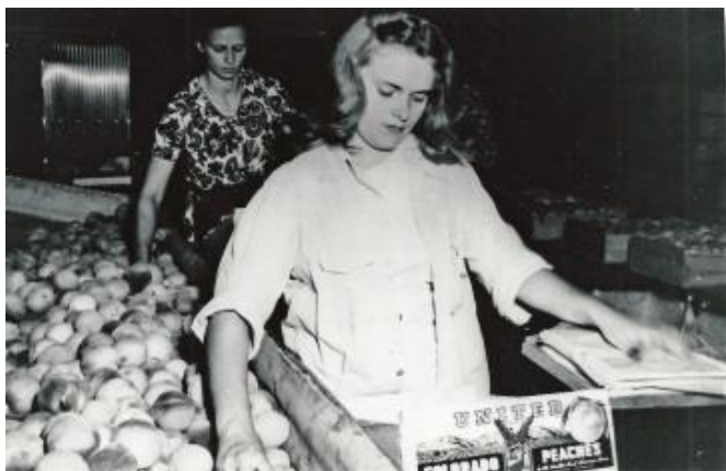
Wrap-packing peaches.

Look for the Palisade Historical Society's booth in Riverbend Park on Friday afternoon and Saturday. We will have peach wrap-packing demonstrations both days to show how peaches were processed 50 years ago, as well as entries in the Saturday parade.