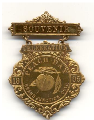
1895 Grand Junction Peach Day Souvenir

Celebrating delicious Palisade peaches with a summer festival—usually in August—has been a long-time tradition in Colorado. There were “Peach Day” celebrations starting in the 1890s, including a number held in Grand Junction.