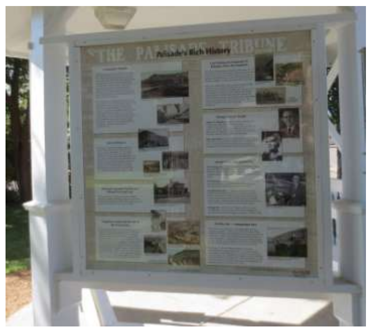
Updated Palisade's Rich History panel in new kiosk location

"We expect the updated panels will continue to attract visitors and locals interested in learning more about Palisade's unique history," Priscilla added.