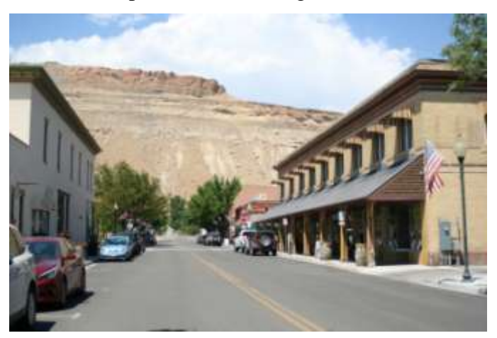
Main Street 2016

In an early photo of Main Street which Ida McKay Shrum recently shared with us, we noticed a spire rock at the very end of the top layer of Mancos Shale on the palisades is no longer there.