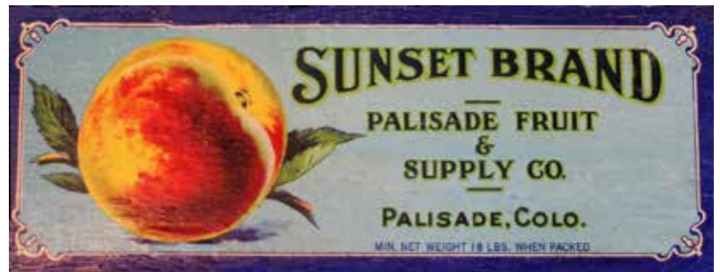
Photo Roundup at the Palisade Library — Sat., May 14, 11:00 – 3:00

The Palisade Historical Society and the Palisade Branch Library Auxiliary are sponsoring a photo restoration service for Historic Preservation Month in May.