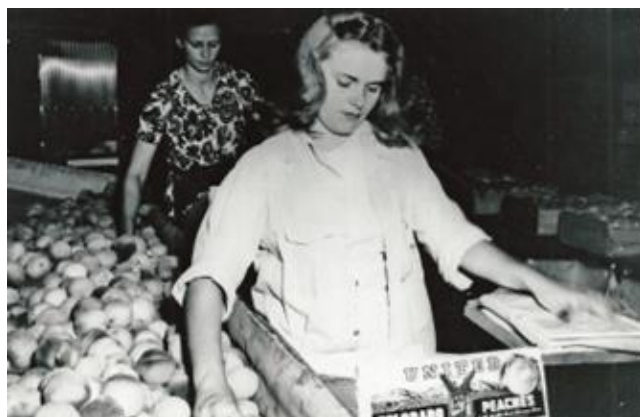
Wrap-packing peaches at harvest in the 1950s.

And Debbie Tsakalos is creating new and fun coloring and fruit box stamp activities for youngsters who attend Fall Day on the Farm.