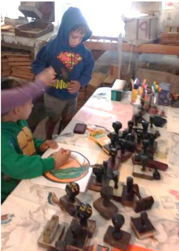
Young artists at Deb's art table at Cross Orchards popular Fall Day on the Farm event in October.