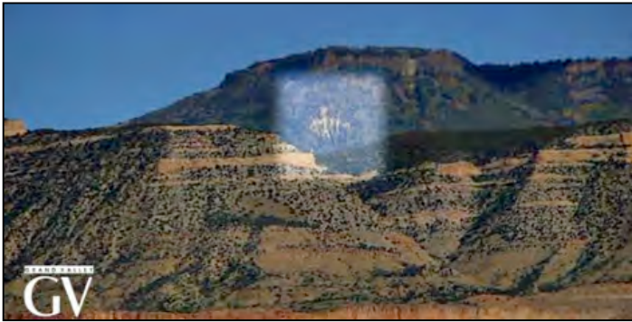
The unusual "thunderbird" design on the side of Grand Mesa is visible from Palisade. Native American legends describe its origins.