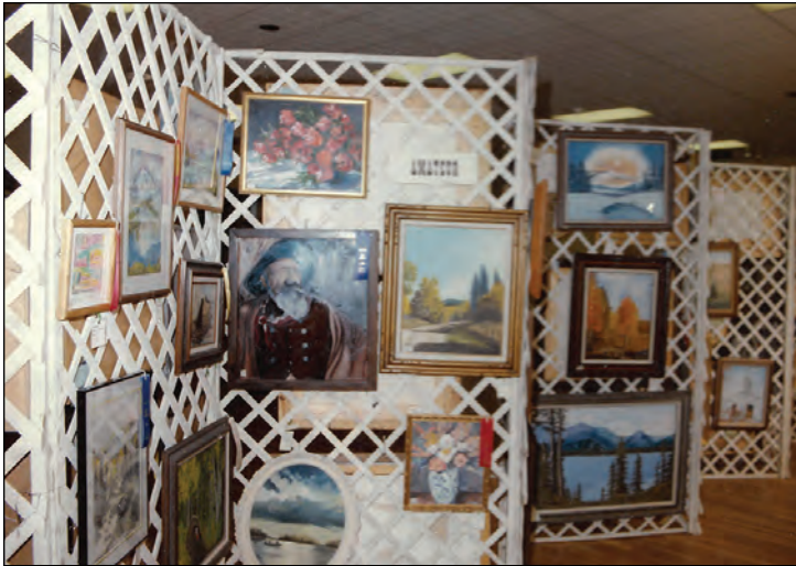
Artwork displayed at the 1989 PALS show