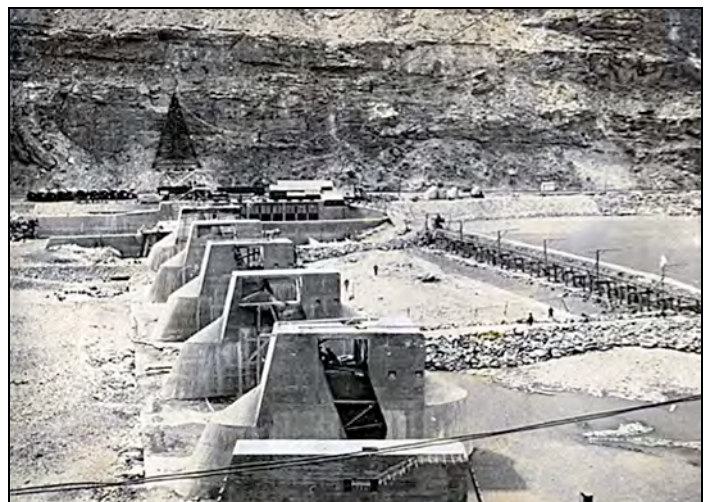
Roller Dam under construction in 1914-1915.