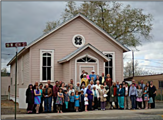
St. Ann's Catholic Church members gather at the original church building. Pick up the Walking Tour brochure or stop by the History Center to see the 1914 photo.