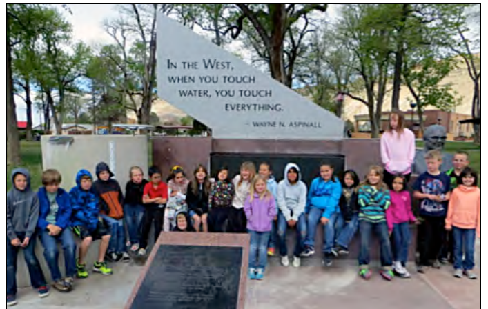
Third graders pose at the Aspinall Memorial in Palisade Park on the way back to school.