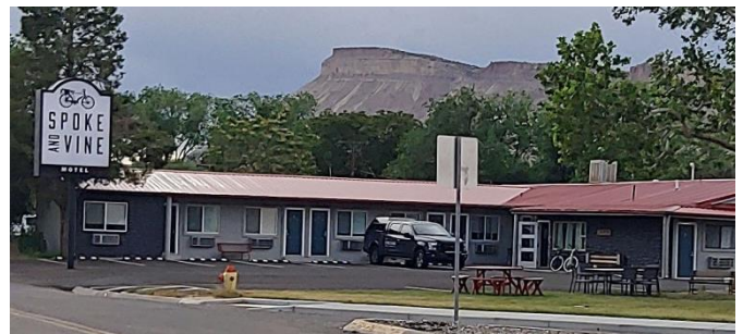
Newly remodeled Spoke and Vine