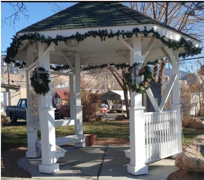
Information Kiosk on Kluge Ave. in downtown Palisade decorated for Christmas