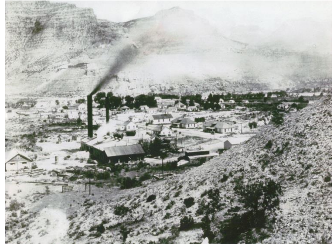
Cameo as a coal-mining town in 1928