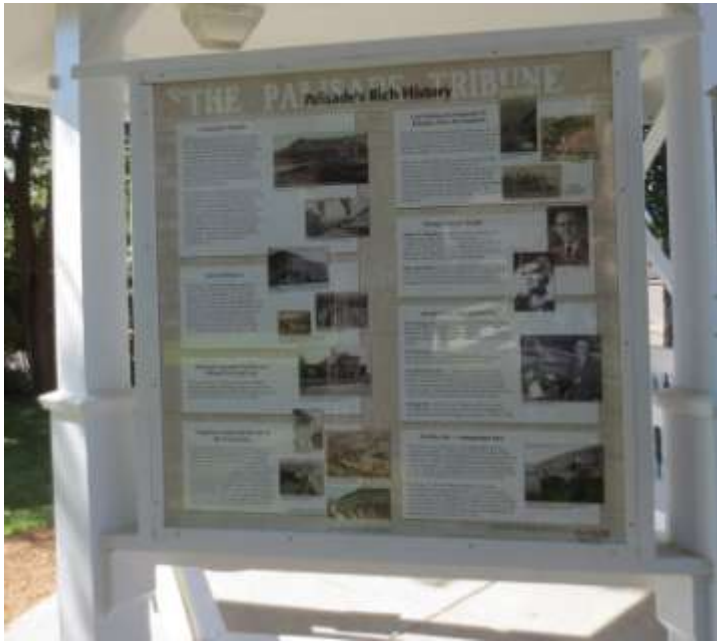
Updated Palisade's Rich History panel in new kiosk location

"We expect the updated panels will continue to attract visitors and locals interested in learning more about Palisade's unique history," Priscilla added.