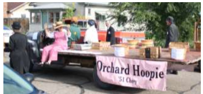
Peach Fest Parade entry in 2015

Join us for the Palisade Peach Festival Parade on Saturday, August 20th which starts at 9:00 and winds through Palisade.