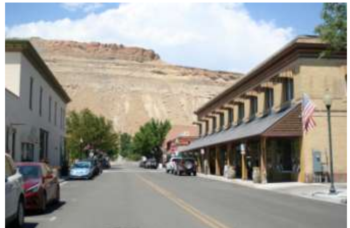
Main Street 2016

In an early photo of Main Street which Ida McKay Shrum recently shared with us, we noticed a spire rock at the very end of the top layer of Mancos Shale on the palisades is no longer there.