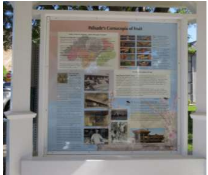
Updated Fruit Industry Panel in new kiosk location