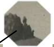
Spire rock on the palisades in 1909

With busy summer and fall schedules, we're looking for additional hosts for the History Center for Wednesdays and Fridays from 10 a.m. to 1 p.m. Please contact us if you're interested in meeting and talking with people who want to learn more about Palisade history and/or working on various committees and projects.